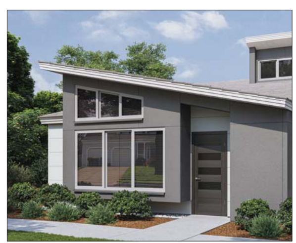
James Hardie Fiber Cement Siding

Mead Clark is your Siding Headquarters! We stock an extensive array of siding choices and can special order any other type you need. We work with reputable brands and are very familiar with the application of our products. Whether you are building from the ground up, remodeling your existing home or replacing your Grandmother's garage, we can guide you through the many, many choices available at Mead Clark Lumber.