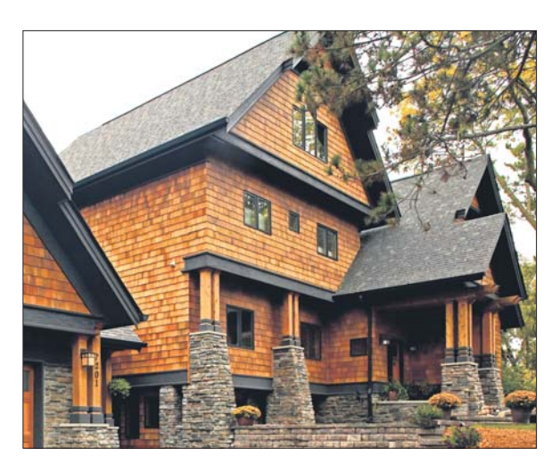
Shakertown Real Wood Siding