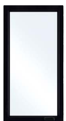
ULTIMATE REPLACEMENT CASEMENT WITH MATTE BLACK HARDWARE