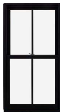
ULTIMATE DOUBLE HUNG NEXT GENERATION WITH MATTE BLACK HARDWARE

It is the complete absence of light, the epitome of sophistication. Black is modern, yet timeless. It transcends the ranks of fashion and has entered into popularity as a home interior finish. As with all Marvin paint and prime systems, Designer Black provides a durable and long-lasting finish on each piece.