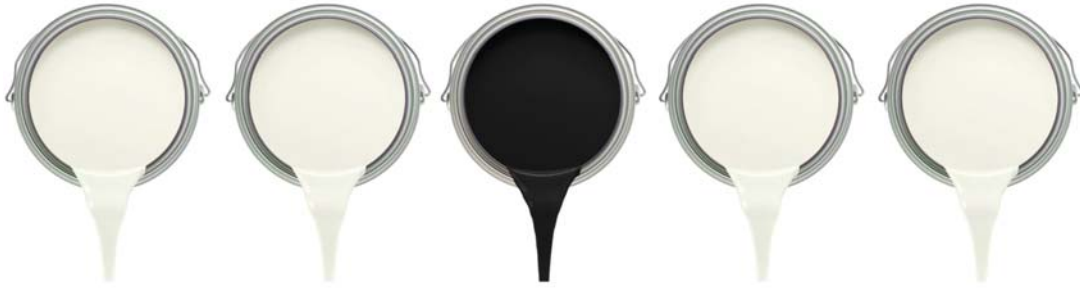
MARVIN DESIGNER BLACK PAINTED FINISH