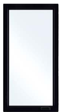
ULTIMATE REPLACEMENT CASEMENT WITH MATTE BLACK HARDWARE