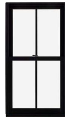
ULTIMATE DOUBLE HUNG NEXT GENERATION WITH MATTE BLACK HARDWARE

It is the complete absence of light, the epitome of sophistication. Black is modern, yet timeless. It transcends the ranks of fashion and has entered into popularity as a home interior finish. As with all Marvin paint and prime systems, Designer Black provides a durable and long-lasting finish on each piece.